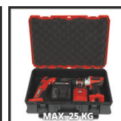
MAX. 25 KG