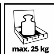
max. 25 kg