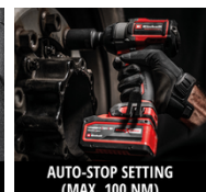
AUTO-STOP SETTING (MAX. 100 NM)