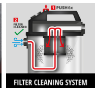
FILTER CLEANING SYSTEM