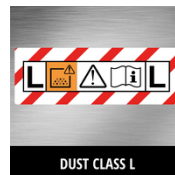
DUST CLASS L